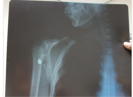
Bullet visible in Teodoro's X-Ray of arm

Great Controversy about the Reformation and how many valiant men and women of God died burned at the stake, and they are now an example