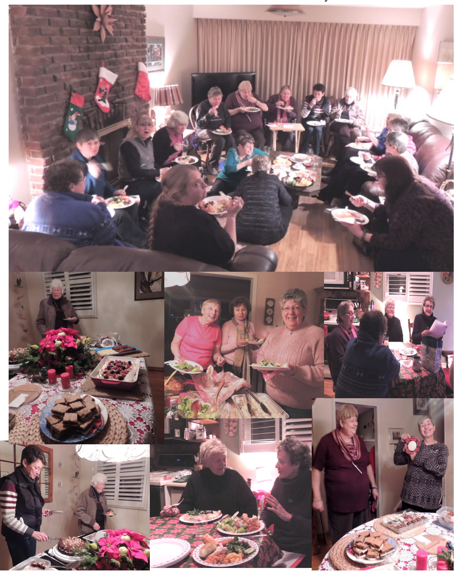
CCTC 2013 AGM and Christmas Party