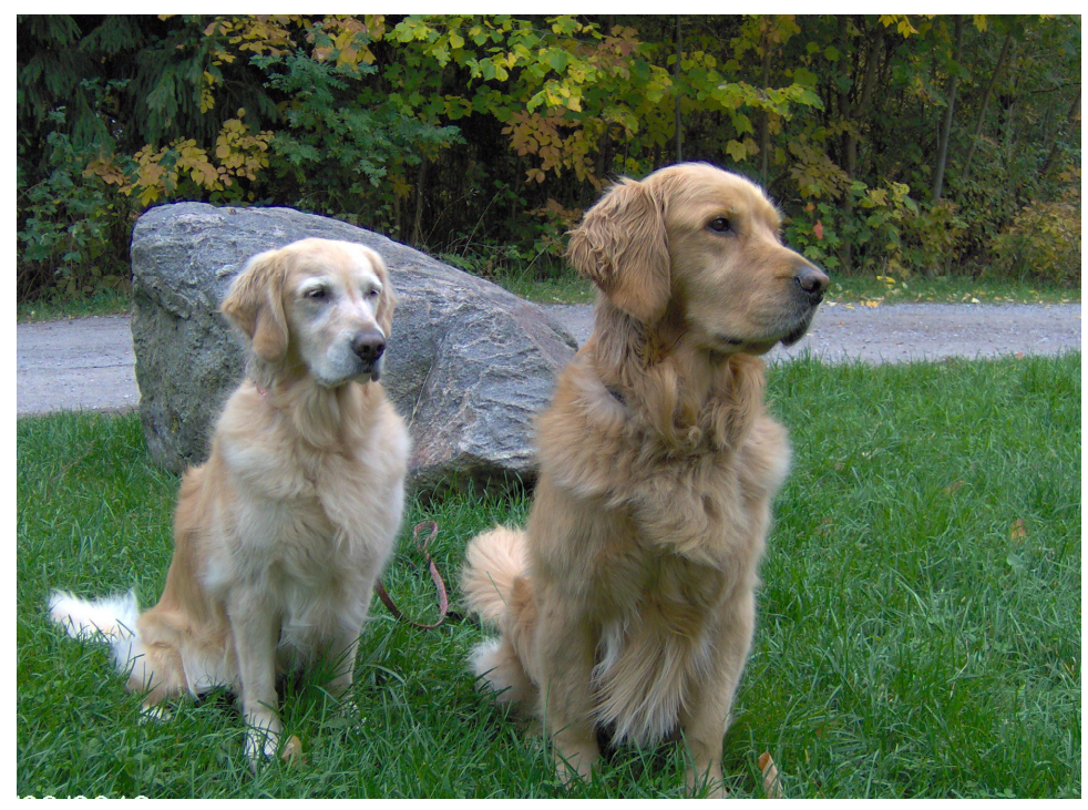
MOTCH Charis Last Honour (UKC) CD RO1 (NAMBR) CD (CARO) RE (CKC) RE JH WCI "Patti" at 11 years old past her WCI, Fall of 2013 Owned by