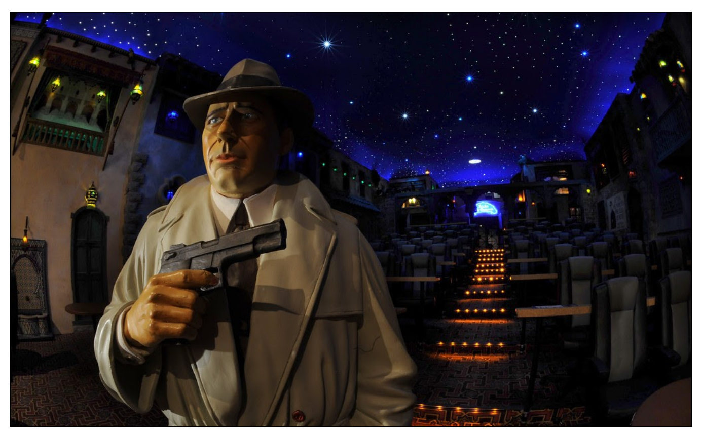
A statute of Rick greats the patrons at the entrance of the new Casablanca Auditorium.