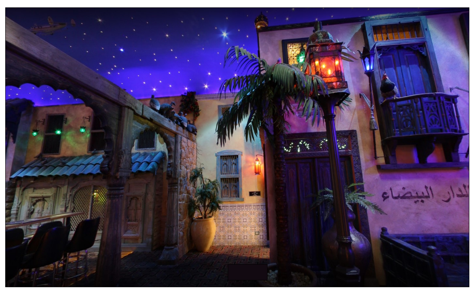
The new Casablanca Auditorium features 11 Moroccan building facades with 1100 fiberoptic stars above.

well. Fortunately, research shows he movie industry is recession-proof." "It didn't take us long to surpass the annual attendance to Chicago Bears attendance at Soldier Field."