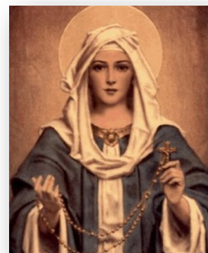
Feast Day: October 7