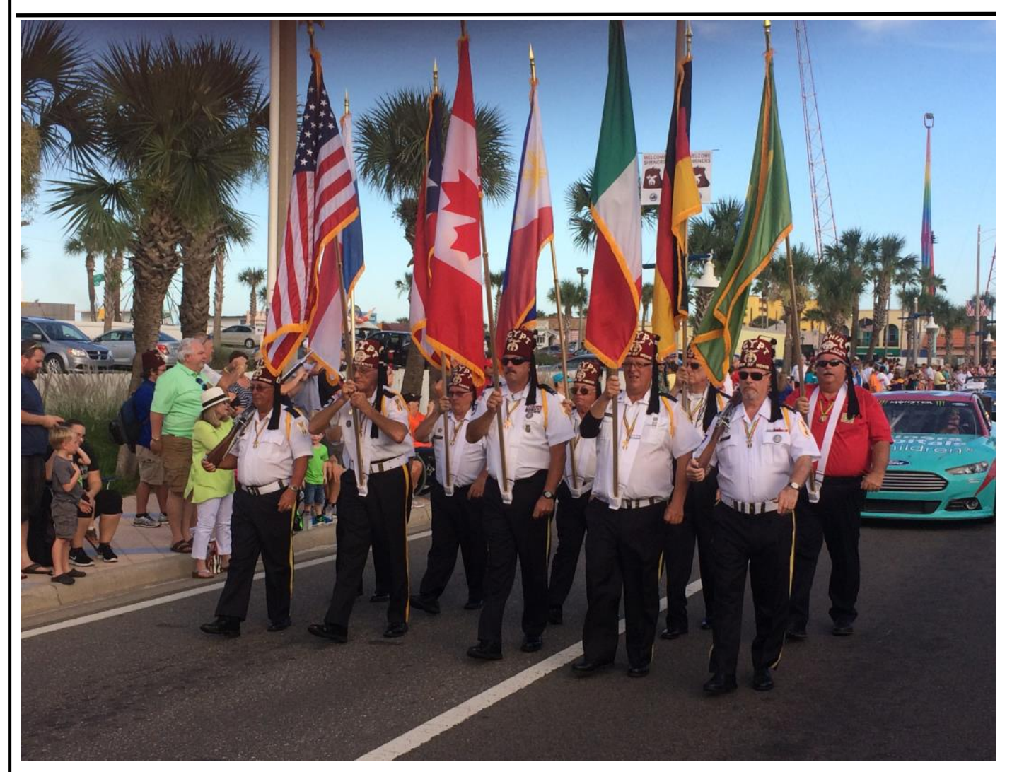
Egypt Legion of Honor carrying the colors at Imperial Shrine Parade in Daytona 2017

Until next time, AIM HIGH and remember, IT'S AN HONOR TO BE IN THE LEGION OF HONOR!