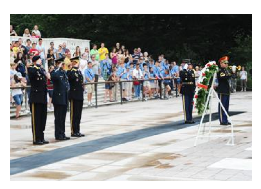
Arlington Wreath Laying Ceremony, honoring those who gave so much.

Deadline for the January Newsletter is 31 December 2017