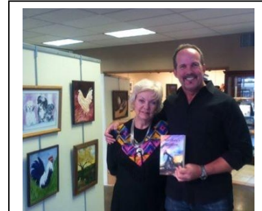
at Book Signing