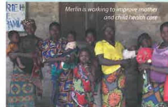
Merlin is working to improve mother and child health care

We have, in the words of one nurse, "helped to breathe life back into the lungs of the primary health care system"