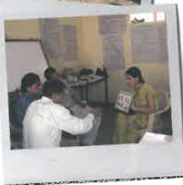
Right: Training is a vital part of Merlin's programme in Nepal

"For people in rural Nepal, getting access to health services can mean a journey of up to two days by donkey, or on foot."