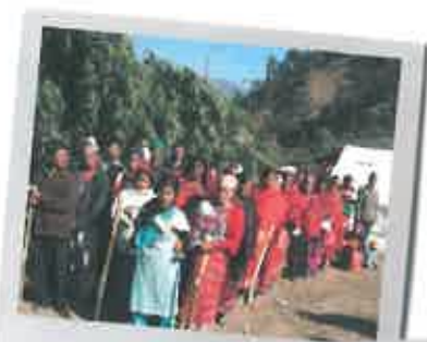
Top: People queue for a mobile clinic in a remote region of Nepal.

Merlin has been working with FCHVs in Nepal since 2006. We believe they are a crucial link to the community and an important way to ensure female participation in the health care system.