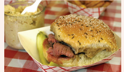
Beef On Weck ..... $9.95 Slow roasted 100% black Angus beef piled high on a hand dipped weck roll.