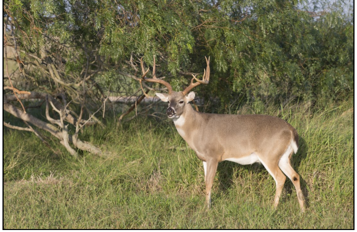
Whitetail bucks, cougars, raccoons and more call the Lampasas River home

Georgetown also is home to the oldest university in Texas. Southwestern University began in 1875 through the combina-