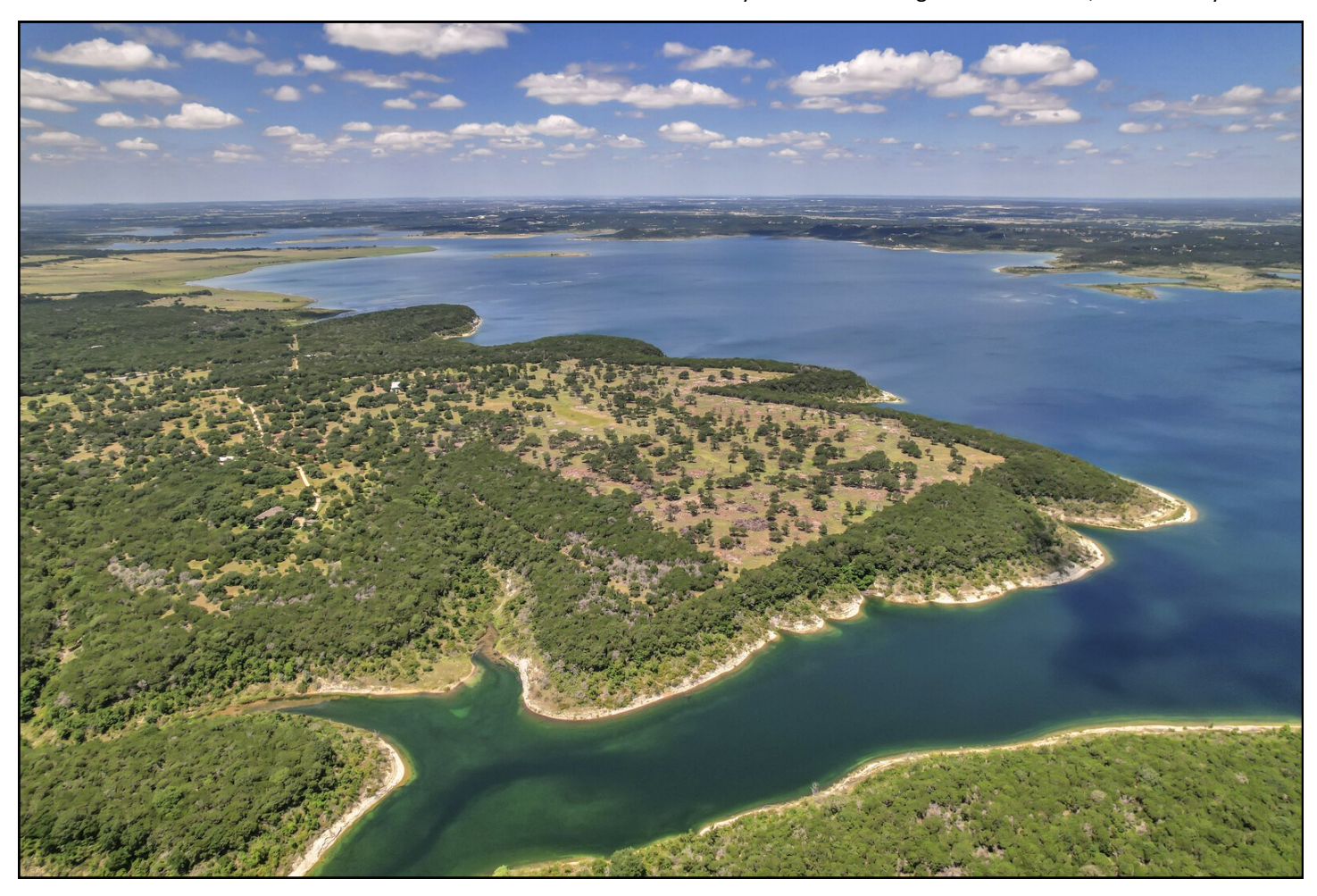
Stillhouse Hollow Lake's 58 miles of shoreline are entirely within Bell County. Construction ran June 11, 1962 through July 1968.