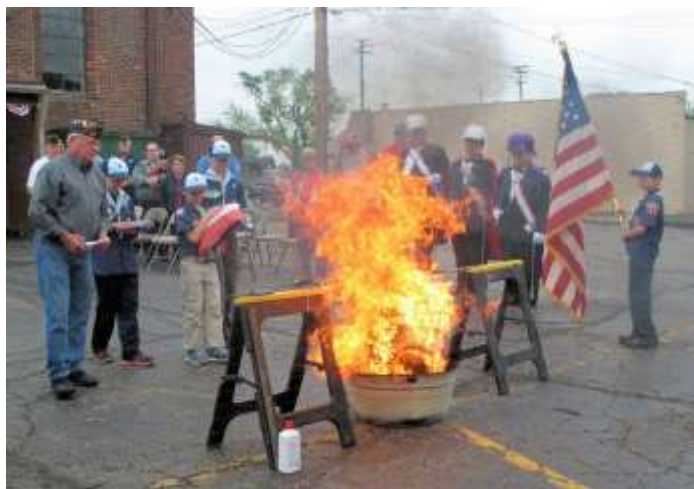
Our traditional annual Flag Day Ceremony is, unfortunately, not very well attended, but holds much meaning for our members, and the K of C and scouts who assist in it. Thank you to the K of C for once again providing delicious refreshments after the ceremony.