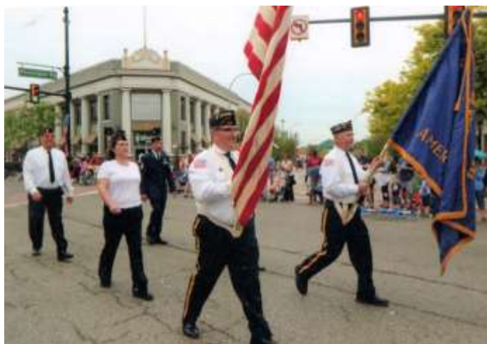
Our Legion members march proudly.