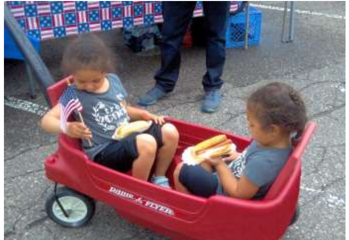
Two of our adorable little satisfied customers at the Post 346 Farmington Farmers Market Coney Dog Booth.