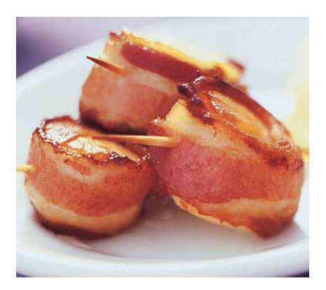
If only ordering Hors D'Oeuvres for your event An additional fee will apply for linens $5 per round or $6 per long needed