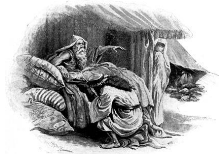
JACOB DECEIVING ESAU.—Gen. xxvii. 16.

Please join us for our annual Harvest Festival on November 17 th at 5:00 PM