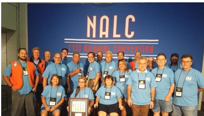
2018 Branch 1477 National Convention Delegates