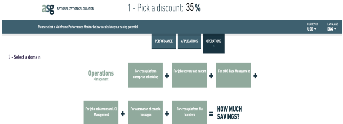
Figure 1 – The ASG Rationalization Calculator