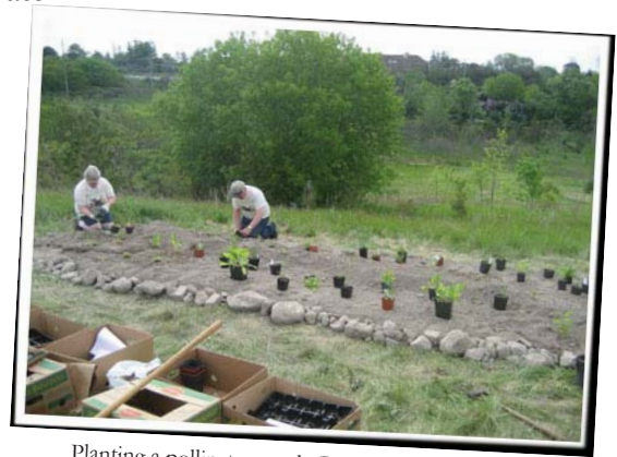
Planting a pollinator patch, Barrie, ON

Native grasses are slow to start. The first year is usually taken up with establishing a deep root system and you might not have a lot of top growth. Don't let that fool you. By Year 3, your grasses will be matured and a real asset to the beauty and usefulness of your patch.