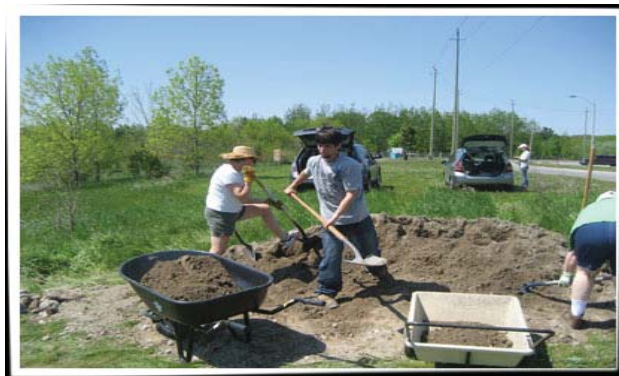
Pollinator Patch, Barrie, Ontario

Your site should be people-friendly, too. If your site is adjacent to a road, make sure there is room to pull a vehicle completely off the road. A safe place for people work in a pollinator patch would be at least 6m (10 feet) away from traffic.