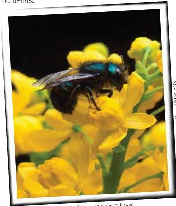
Osmia ribifloris on barberry flower.

The pollinators native to Ontario are predominantly bees but the number also includes beetles, moths and butterflies.