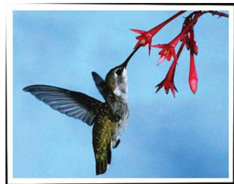
from the Web

In order to assist pollinators, you and I can make sure that our native pollinators have someplace to stay and something to eat. The chart on the next page will help you with your habitat choices