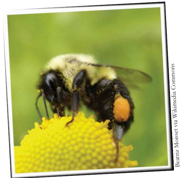
Beatriz Moisset via Wikimedia Commons