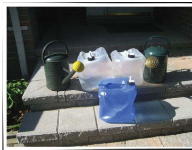
Our low-tech watering system

The pilot patch had no source of water so it was necessary to truck water to the site. We thought it would be onerous but with our solution of water bladders and watering pails it worked out fine. We used three water bladders purchased