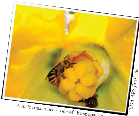
A male squash bee -- one of the specialists