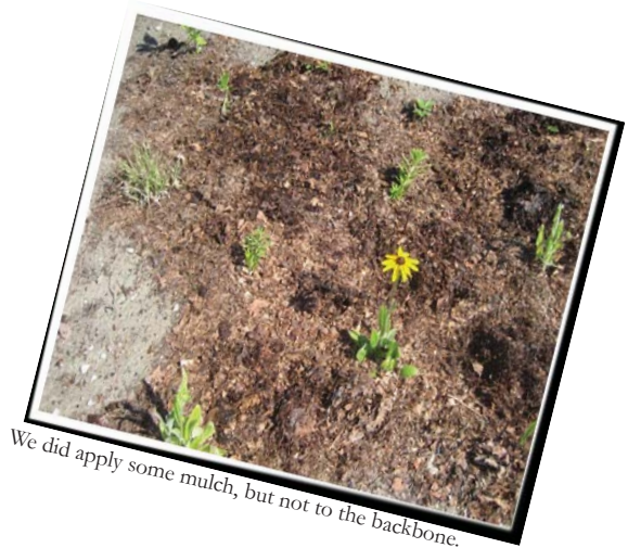
We did apply some mulch, but not to the backbone.

Make a point to visit and inspect your site often during the growing season of the first year. Learn to recognize the weeds in the area and eliminate them before they can gain a foothold in your pollinator patch.