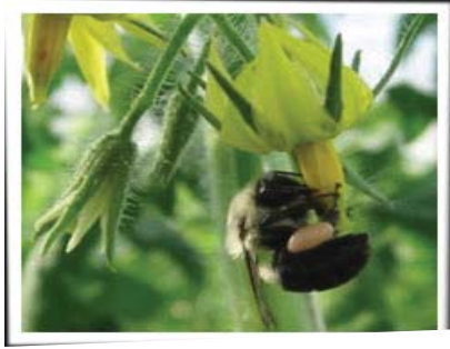
Gipaanda Greenhouses, BC

Of interest to tomato growers is the ability of bumblebees to use a method of obtaining pollen not practiced by honeybees, called “sonication” or “buzz pollination.”