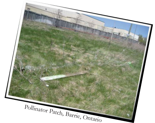
Pollinator Patch, Barrie, Ontario

Keep dead or dying trees and branches whenever it is safe and practical. Wood-boring beetle larvae often fill dead trees and branches with narrow tunnels into which tunnel-nesting bees will move. In addition, retain rotting logs where some bee species may burrow tunnels in which to nest. If your site doesn't have a place for