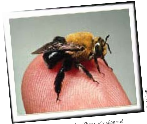
Native bees are not aggressive. They rarely sting and then, only because they are personally threatened. Here a native bee rests on a biologist's forefinger.