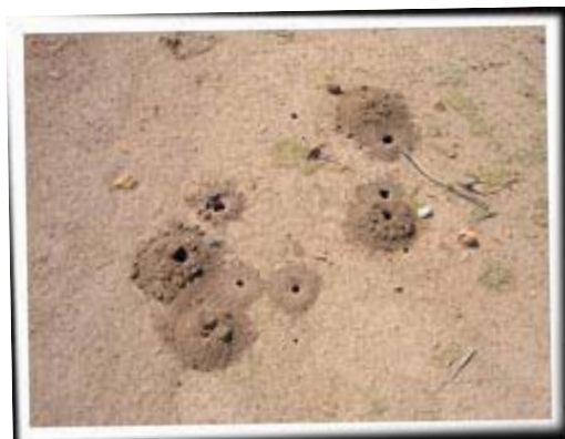
Burrows of ground nesting bees. How easily these could be mistakend for ant burrows

In general these constructed ground nest sites should receive direct sunlight, and dense vegetation should be