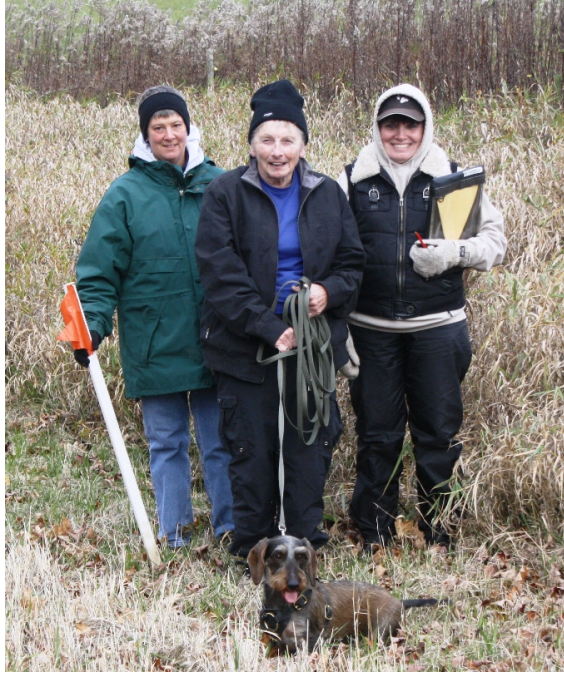
CH. Victory's Bean With The Devil TDX CD RE AGI AGIJ "Dexter" earned his CKC TDX Nov 4, 2012. He is also #1 Std. Wire-Haired Dachshund and #8 Hound for 2011 in CKC Obedience.