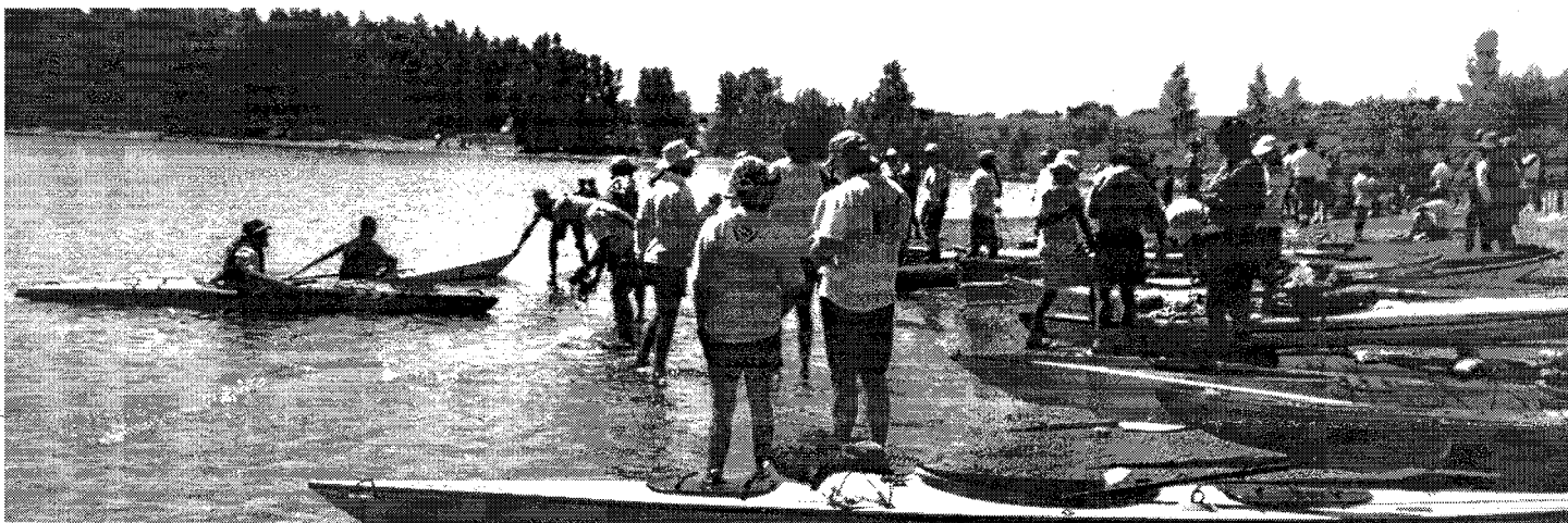
A Big Gathering for Our 1999 Paddlefest