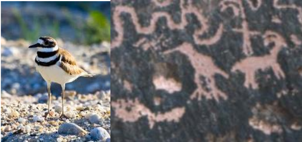
Kildeer, Public domain.

"Killdeer are a type of plover, similar to the snowy plovers that nest along the shores of the Great Salt Lake. The killdeer, however, is well at home in dry upland habitats. Killdeer nest on open ground, digging just a shallow scrape in the soil. Gravel roads are often ideal nesting habitat because killdeer eggs blend in very well with nearby pebbles. The spotted eggs and young hatchlings are very cryptic, invisible to the eye even when they are underfoot. This dangerous breeding strategy can often lead to trampled nests. Or, if a predator has a good sense of smell, the eggs and young are easily eaten." (Larese-Casanova)