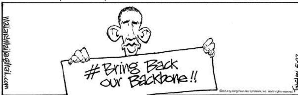
Mallard Fillmore by Bruce Tinsley