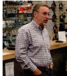
Chandler RW hosted the fantastic Girls with Guns in November 2015, with Rep. Matt Salmon joining the event to speak about 2nd Amendment Rights.