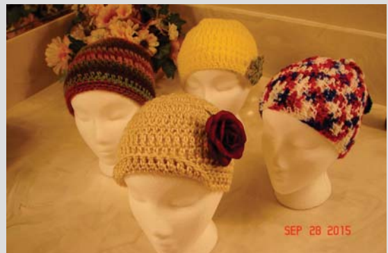
Lake Havasu's Chemo Caps for Cancer project