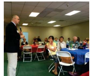
Congressman Matt Salmon brings ladies of Mesa RW to date on federal issues.