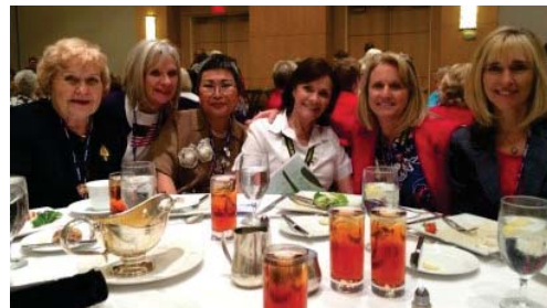
Mesa RW ladies attending the AzFRW State Convention and NFRW National Convention in Phoenix.