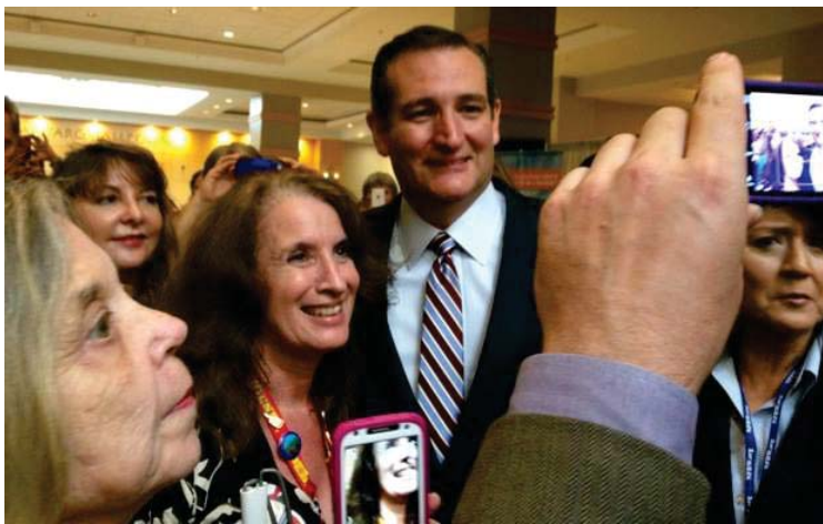
Tempe RW 1st Vice Chair with Republican presidential candidate Ted Cruz at the NFRW convention in Phoenix.