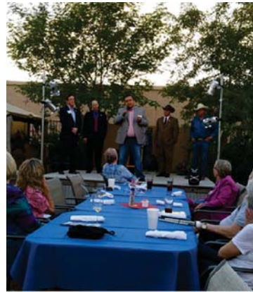
Grande Valley RW Candidate Forum.