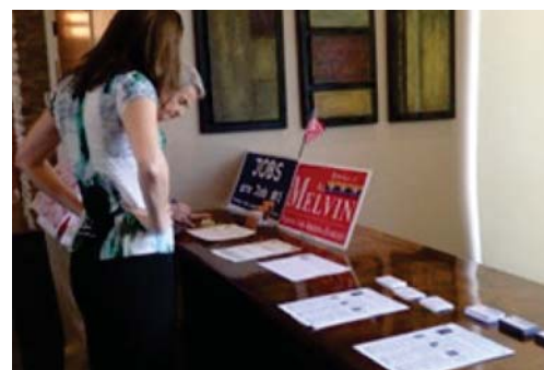
Corporation Commission Candidate Senator Al Melvin uses his campaign table to collect signatures at a recent meeting.