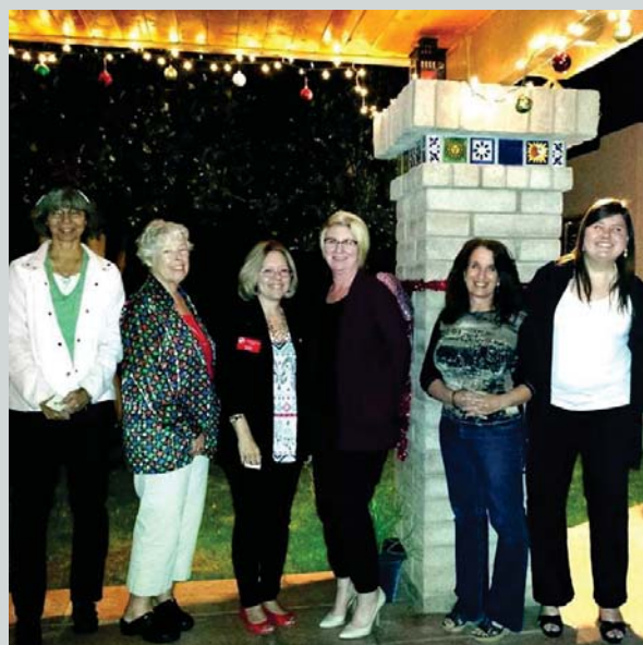
2016 Tempe RW Board Members.