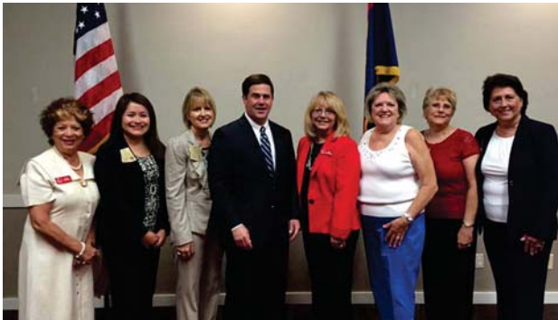
Ahwatukee RW hosted a breakfast featuring Governor Doug Ducey in August 2015. Pictured: Ahwatukee RW Executive Board with Governor Ducey