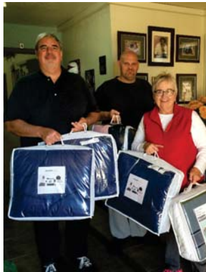
In November, Mesa RW delivered their Caring for America donations to A New Leaf's homeless shelter for men.