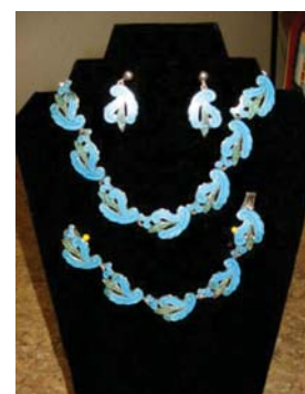
Just one example of many donated items for Flagstaff RW's jewelry fundraiser.