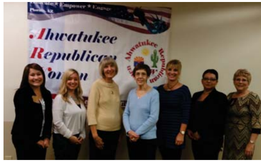
In November, Ahwatukee RW elected our 2016-2017 Executive Board.