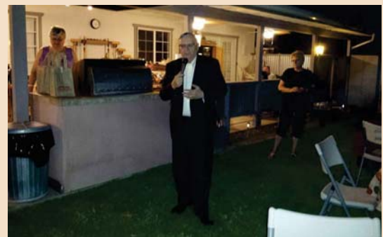
Sheriff Joe Arpaio was the guest of honor at ARW's Member Appreciation and Chili Cook-Off Dinner.

Mesa RW will continue to work hard in 2016 to educate, inform and inspire their members so that they can help get Republicans elected in November, especially in the White House! Together we DO make a difference.