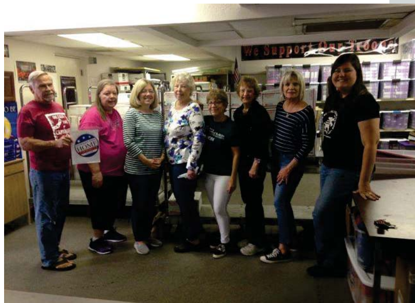
Tempe RW helping our troops by preparing care packages for Packages from Home.

Central RW of Phoenix had the challenge of finding a new venue for meetings held on the first Thursday of each month. The new location is Phoenix Hilton Suites at Central and Thomas Avenues. They held a wonderful male associate member's night which resulted in one of the largest turnouts in recent memory. The club maintains a consistent Social Media presence using Facebook and Group Facebook pages. Their electronic Newsletter continues to be appreciated by their members and friends.