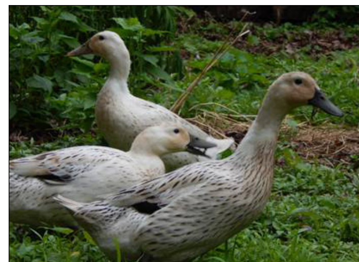
Above, a drake Welsh Harlequin; below, a hen

differences in bill coloration, so that breeders can determine the sex of ducklings with a fair level of accuracy just by observing the ducklings' bills.