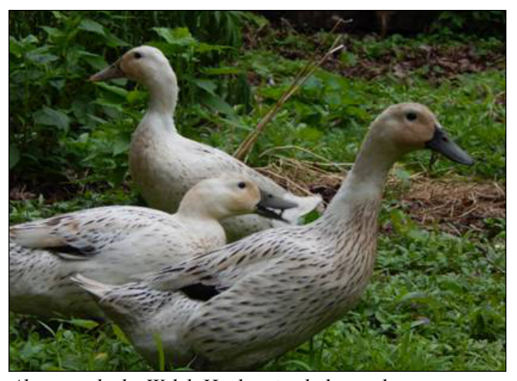
Above, a drake Welsh Harlequin; below, a hen

differences coloration, so that breeders can determine the sex of ducklings with a fair level Campbells, a breed that They typically have orange of accuracy just by observing the ducklings'