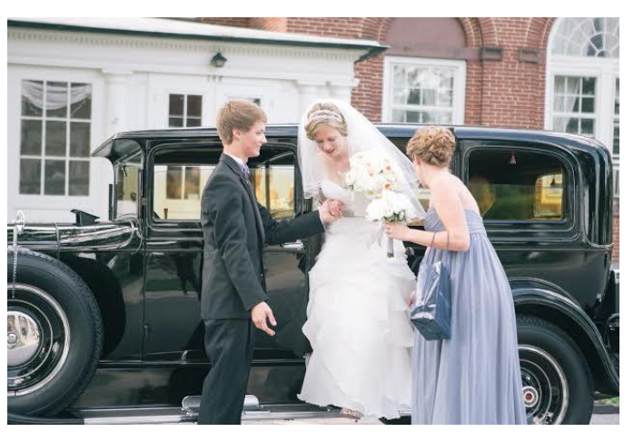
The Bride emerges...