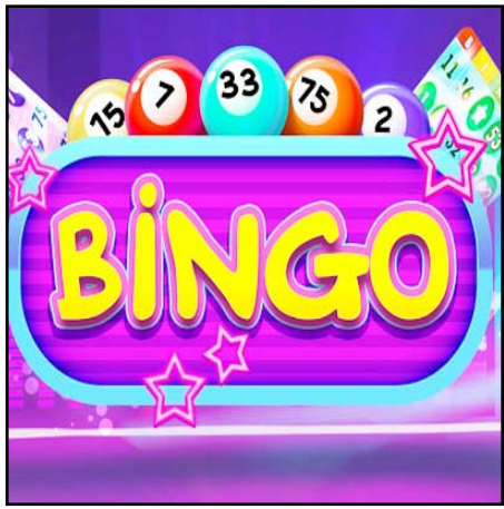
Aug. 2nd & 16th 6:30 to 9:00p.m.