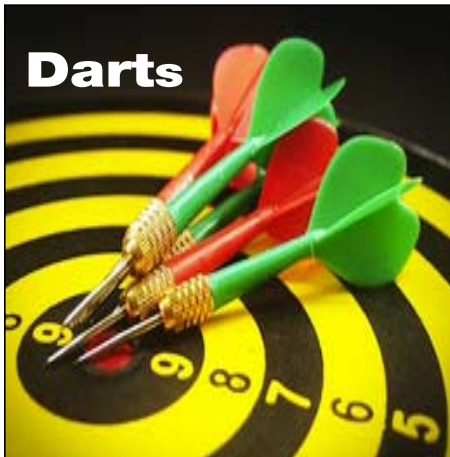
Every Thursday starting at 6:00p.m.