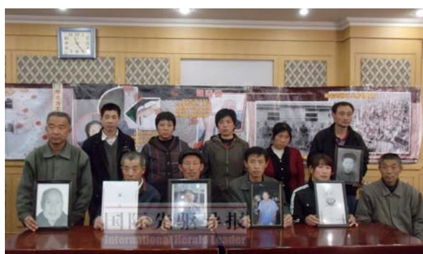
The five plaintiffs in the Shinanogawa lawsuit against Nishimatsu, along with heirs of two other victims, announce their opposition to the compensation pact at a

ambiguously name the damages that they should have paid to the Chinese victims; and (c) Moreover, Nishimatsu unreasonably requires those who accept the "settlement" to bear hereafter the obligation of ensuring that the corporation will be immune from any future liability from any other parties for this case. This article discusses these and other shortcomings of the unacceptable "settlement" in detail.