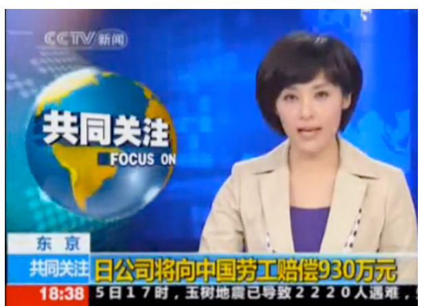
Chinese news coverage of the Nishimatsu-Shinanogawa settlement and its rejection by plaintiffs involved in the lengthy litigation. (CCTV <u>video</u> available)

on April 26, 2010, Nishimatsu continued to include the plaintiffs who had already openly stated their rejection of this Settlement Agreement in its "settlement" arrangements. While Nishimatsu has yet to resolve its wartime forced labor issue, it violates de facto the human rights of the Chinese forced labor victims once again.