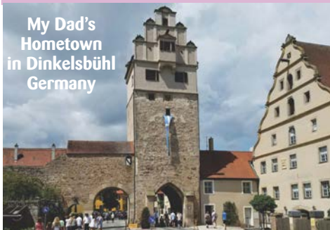
My Dad's Hometown in Dinkelsbühl Germany