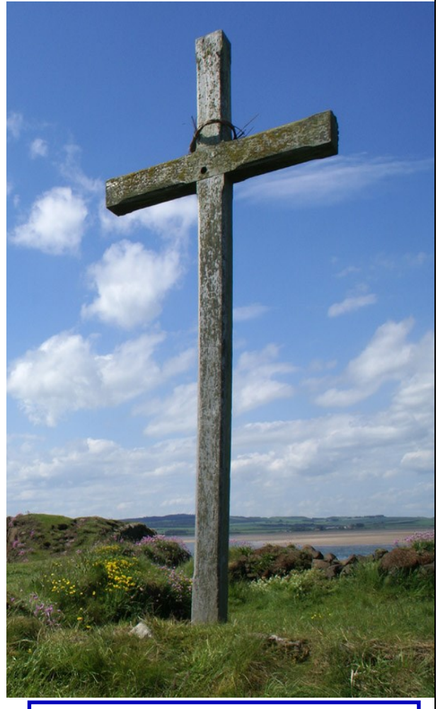
The cross symbolizes God's, immeasurable love.