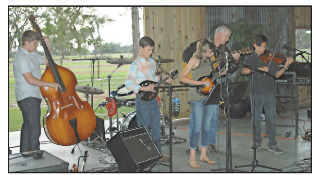
The bluegrass band composed of students from Union Academy (and their music instructor), make their musical debut at the Grand Old Orphy BBQ fundraiser.

During one of the breaks between musical acts, Heidtmann told about the Orpheum Theatre, as well