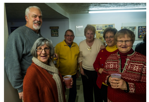
On March 16 another large group met at Lake Road Inn.