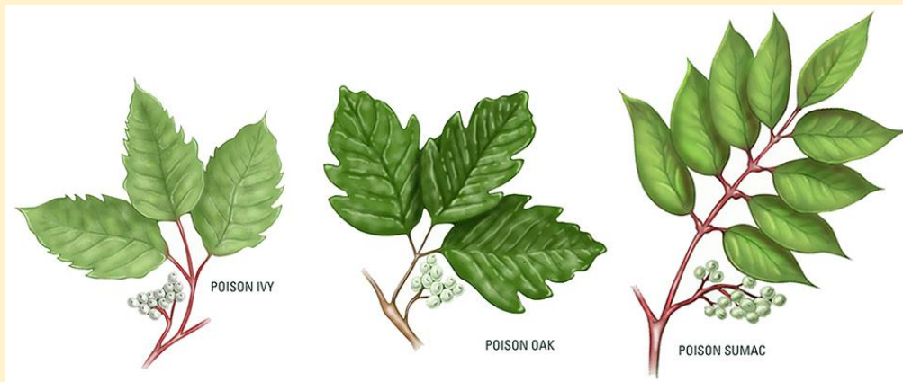
Figure 1 Poison Ivy, Oak & Sumac

Poison sumac is the least common in our area. Poison sumac has many leaves (7-13 per stem), and it loves the water. It most often lives in boggy areas around streams and creeks. It is not vining – it looks more like a small tree or shrub.