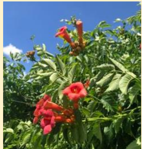
Figure 3 Trumpet Vine

For all of you old-school Southerners, trumpet vine is also known as “Cow Itch” because when cows would encounter it, they would later be seen scratching at fence posts. While certainly the most beautiful of all of the itchy plants, trumpet vine causes a reaction in A LOT of the people who come into contact with it, so I’d advise against putting it in a vase. It usually grows in shady, neglected areas and has red-orange blooms that look like a trumpet. The flowers are much larger than red honeysuckle plants – they are usually about the length of your thumb.