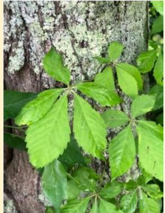
Figure 2 Virginia Creeper

Virginia creeper looks a lot like poison ivy, however it has five leaves rather than three. It is extremely common. Far fewer people have reactions to Virginia creeper, however it is important to be aware of its nature and that some have strong reactions to it. Reaction to Virginia creeper is most common after touching the sap of the vine (such as during the removal of the plant as opposed to just touching the leaf), and reactions are more severe when they contact an open sore or wound.