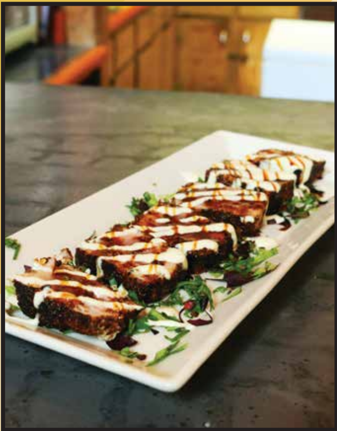
Pan-Seared Ahi Tuna