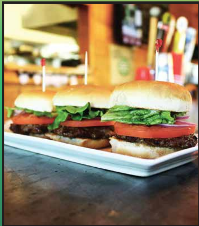
Kobe Beef Sliders

A 4oz piece of Ahi Tuna, blackened and drizzled with sweet soy sauce reduction and wasabi aioli.