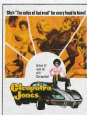
Regal ride: Cleopatra Jones rolled in a 1973 Corvette with automatic weapons.

The third-generation Corvette, the C3, was produced from 1968 to 1982 and included the second-generation Stingray (rebranded as one word). The 1968 models, which started at $4,320 ($30,000 today), featured a redesigned body (but maintained the hidden headlights) and a more powerful engine, including a turbo option. Mark Wahlberg's Dirk Diggler drove a '77 Corvette in Boogie Nights , and in honor of its 25th anniversary, the Corvette was named the official pace car of the 1978 Indy 500.