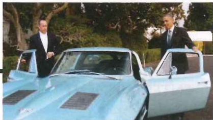
O-mobile: Jerry Seinfeld got coffee with Barack Obama in a 1963 Sting Ray.