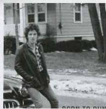
Boss car: Bruce Springsteen bought himself a 1960 Corvette after the success of Born to Run .

Displayed as a concept car at a 1953 General Motors auto show, the C1 Corvette was sped into production in June 1953. Only 300 were built, with a sticker price of $3,498—about $32,000 today—and they now sell for more than 100 times that at auction. John Wayne was one of the first owners of the two-seat fiberglass convertible, which came with a 150-hp straight-six engine. It was available only in white with a red interior, and it had just two luxurious options: a heater and an AM radio.