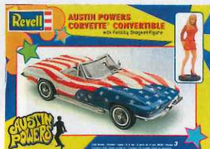
Hot wheels: Austin Powers worked his mojo on Felicity Shagwell in a 1965 Corvette convertible.