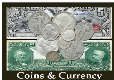
Coins & Currency