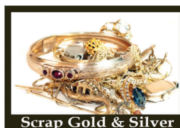
Scrap Gold & Silver