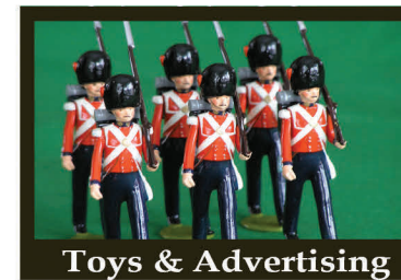
Toys & Advertising