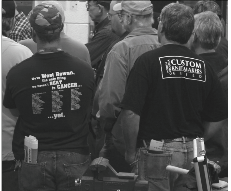
Shirts send a message.