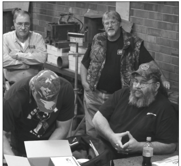
Our Guild members like their camouflage.