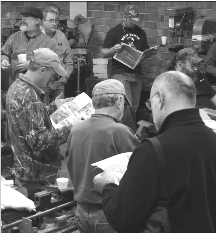
It's a fascinating read, guys!