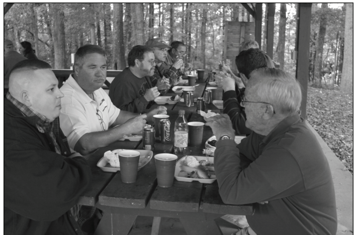
Good eats, good friends, good music, good times.