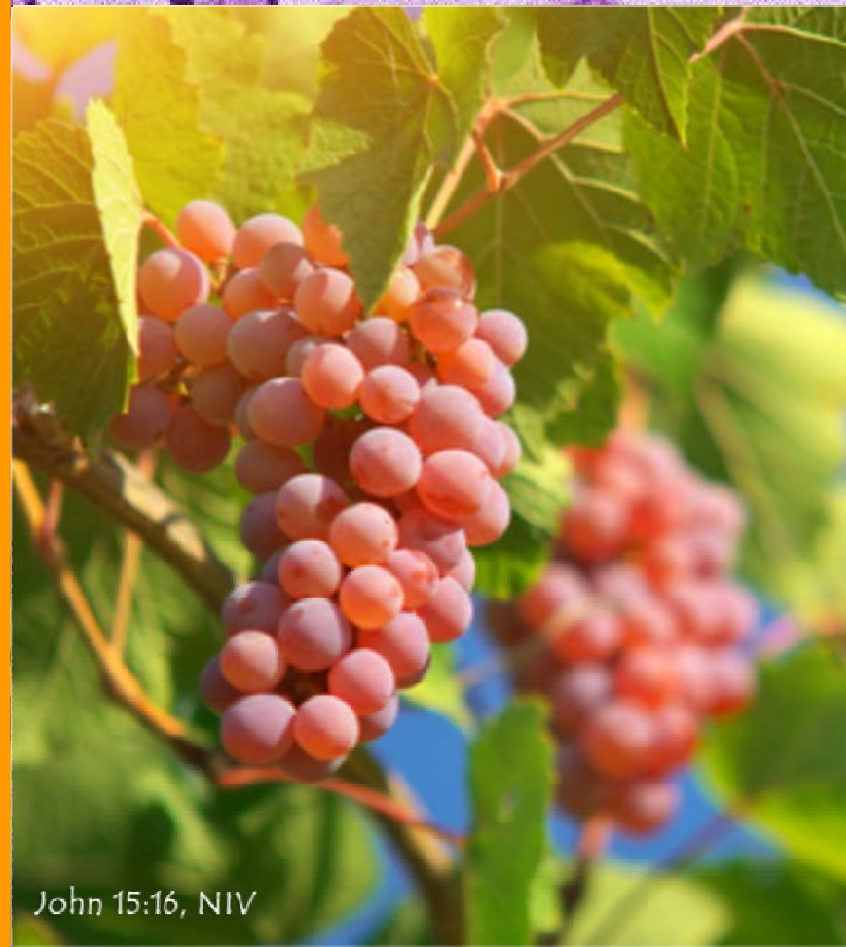
John 15:16, NIV

2. God chose us to serve as first fruits of all he created.