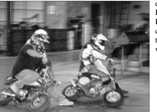
A spy photo of the Z50 racing, shot somewhere in Southwest Missouri. Those bikes are almost touching the handle bars to the ground.

On a sad note: Stan Hammock, former owner of Brush Bust-