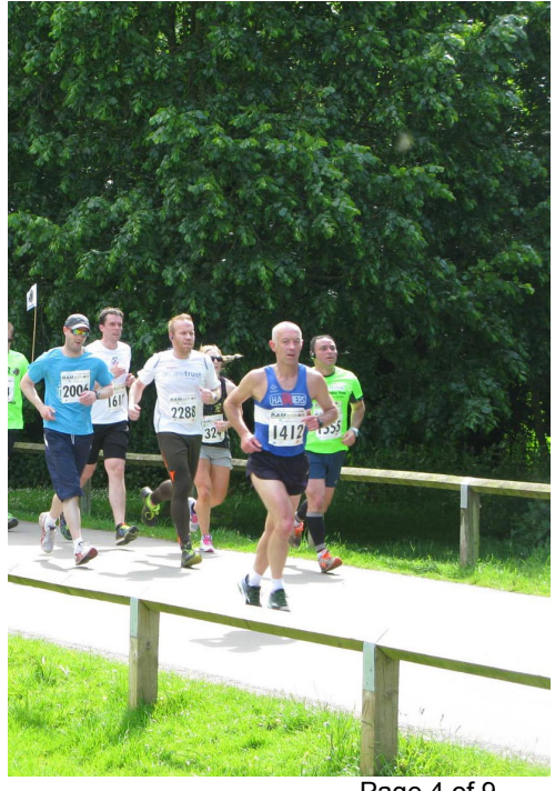
Page 4 of 9

Editor: Bill Southgate. billsouthgate337@btinternet.com. Rolls-Royce Harriers June 2015