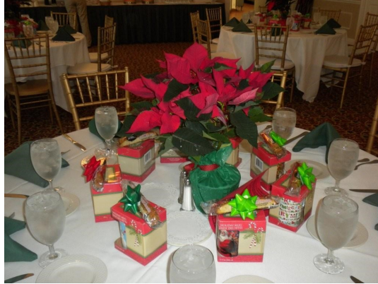
Centerpiece and gifts provided to members