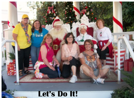
Let's Do It!