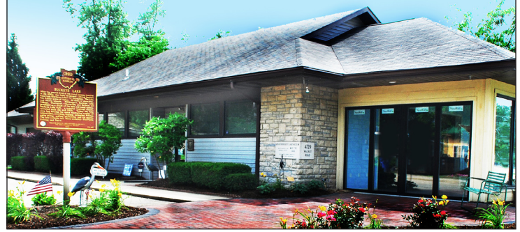
The 15 Year Anniversary Celebration will be held at the Society's Museum

Since those humble and exciting beginnings, the Society has seen many changes: The Queen of the Lake II Tour boat, 2 additions to the building, the management of Cranberry Bog, enlarged gift shop, an entire estate was bequeathed to the society, 6 boats have been donated and one canoe. In the beginning,