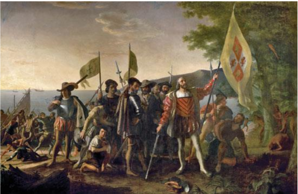
An 1846 painting depicts Christopher Columbus and members of his crew on a beach in the West Indies after arriving on his flagship Santa Maria Oct. 12, 1492. The work was commissioned by the U.S. Congress and installed in the Capitol Rotunda in 1847. Landing of Columbus, 1846, by John Vanderlyn

Nonetheless, there have been political efforts to strip Columbus of honor, and the question of whether to continue to recognize Columbus Day is under review in many places. Some states and municipalities have removed the explorer's name from the holiday or eliminated the observance entirely.