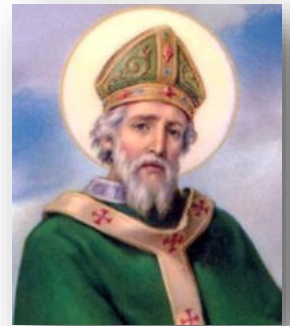
Feast Day: March 17