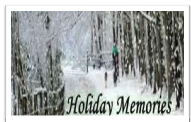
Please send in articles of Holiday memories- any holiday- for our October edition!