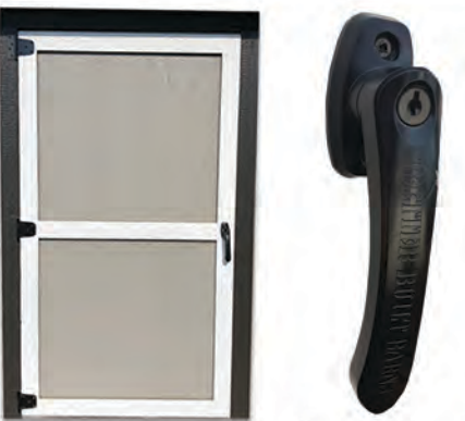
Standard 41" Door Heavy-Duty Door Handle

HOW MUCH CLEARANCE IS NEEDED? We need at least 24" around the building for construction. You will appreciate the extra room when painting the structure.