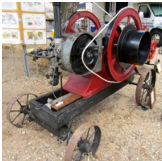
1910 5HP Gilson Style "F"