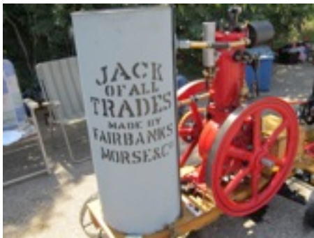
Jack of All Trades