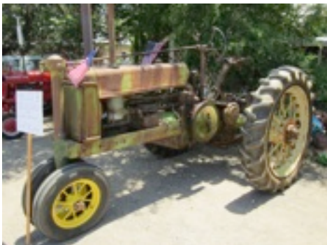
1935 JD "B" 16h.p. 81 years old