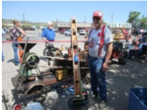
Gary's Do it all machine