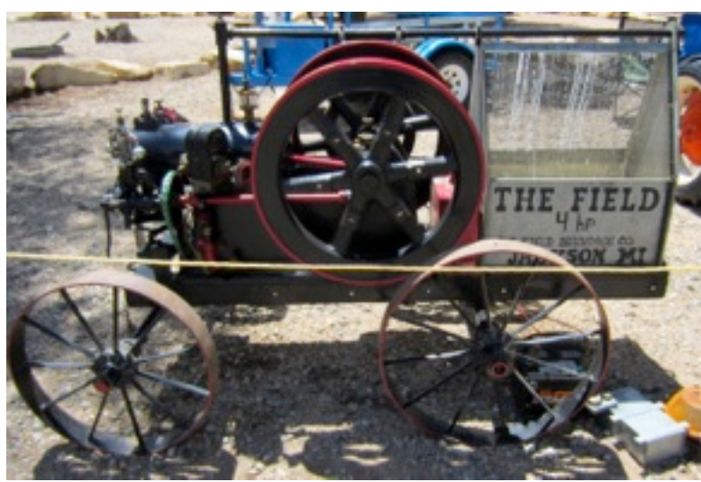
The Field Engine