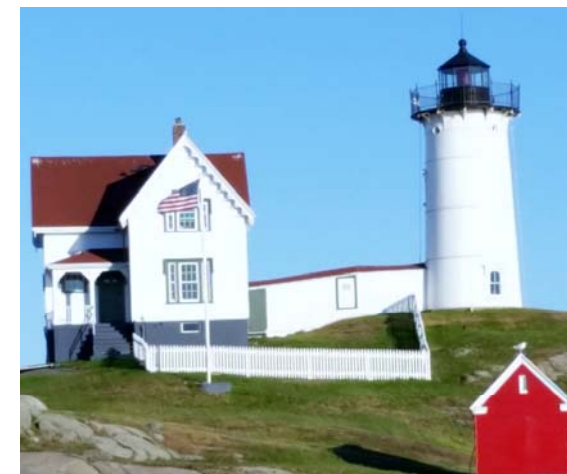
Nubble Lighthouse, Cape Neddick