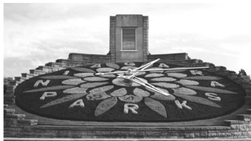
The Flower Clock, Niagara Falls, Ontario