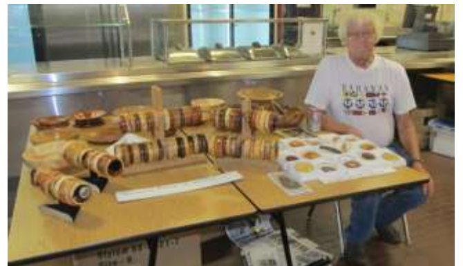
Dusty with baubles, bracelets, and necklaces is ready for