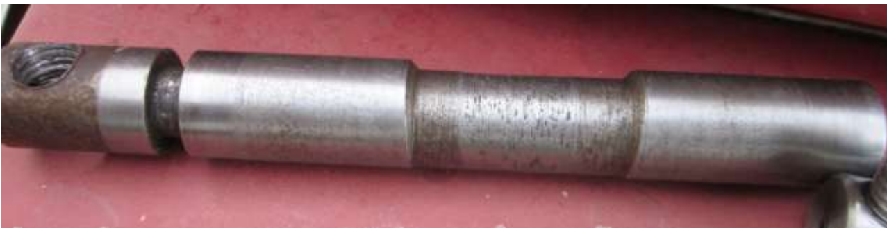
Old worn shaft

I had a problem with wood chips and particles getting lodged under the body of the tailstock and jamming it against the ways on my lathe. Upon inspection I discovered that the off center lobe on the shaft that is used to tighten the tailstock to the ways was worn allowing for a gap to exist. Bob Monaghan solved the problem by turning me a replacement.