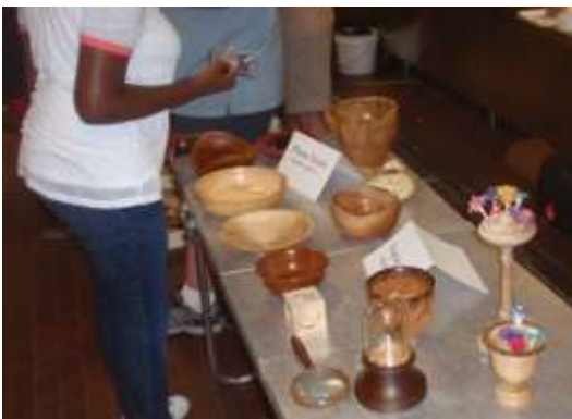
A woman looks at display items.