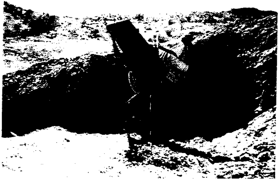
Dry washer, light and portable.

A dry washer for recreational prospecting might consist of a rectangular screen with 1/2 inch openings over a sloped trough. The screened material would pass from the lower end of the trough to the head end of a sloped riffle tray consisting of cotton fabric stretched over an inner frame. The tray includes sides to contain the flowing material, and its surface is interrupted by