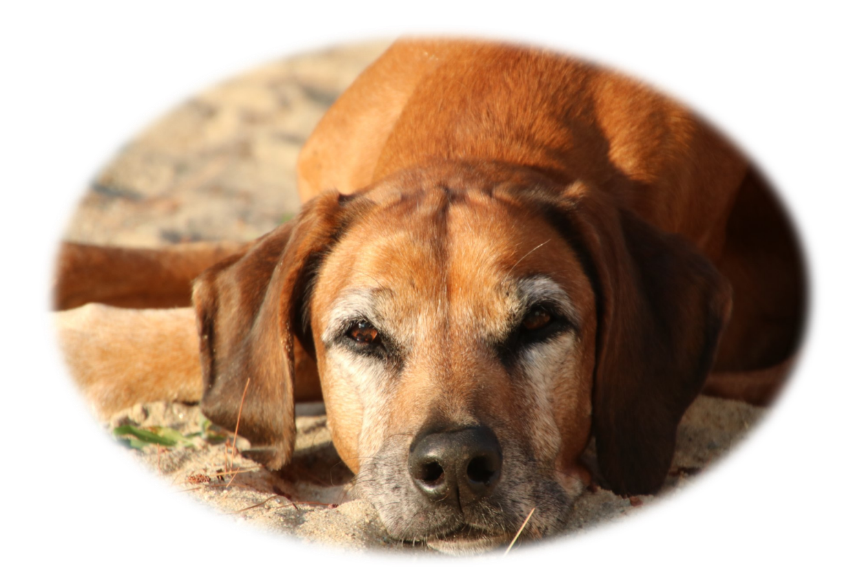
My face may be white, but my heart is pure gold. There is no shame in growing old ~ Anonymous