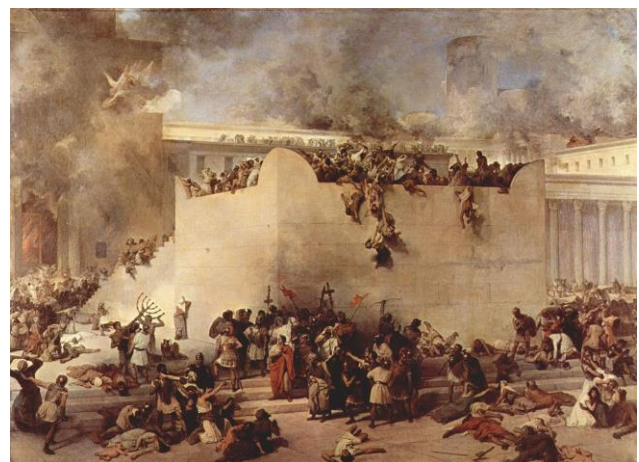
The Destruction of the Temple of Jerusalem by Francesco Hayez