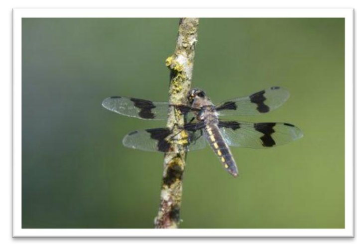
Above: Eight Spot Skimmer, Photo by Tapio Holma Cover Photo: A Quiet Finnish Lake (www. globeimages.net)

"Gratitude is the fairest blossom, which springs from the soul." - Henry Ward Beecher