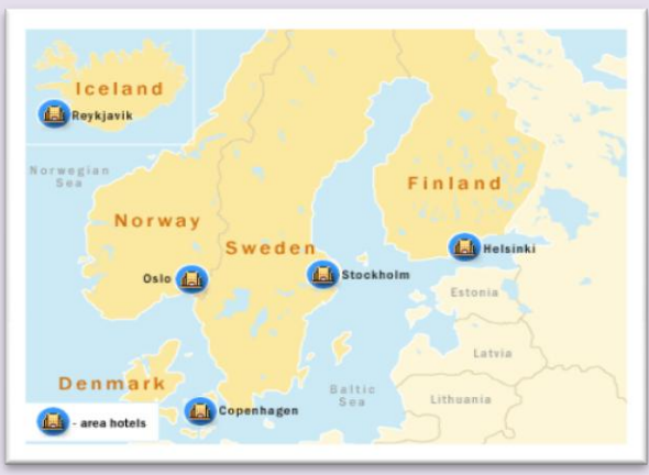
Like in this picture, Finland is often depicted as being part of Scandinavia, when it in fact is not

> Fennougrist = fenno-ugrish language expert > The Fenno-Ugrish languages are Finnish, Estonian, Hungarian (largest) and many other smaller groups found mainly in the Russian Federation.