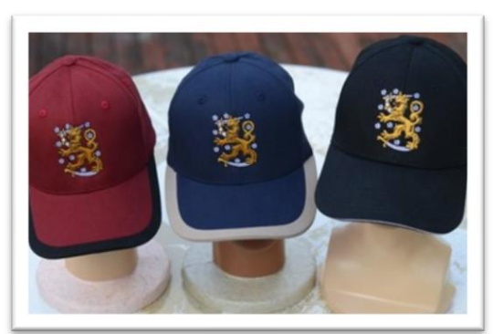
Special: $15 for all new members and those renewing by September 1st.