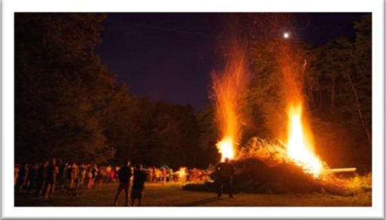
Traditional Juhannuskokko (bonfire) (www.fincamp.org)

What: Potluck - bring a dish to share Where: Lake Padden by picnic tables When: Sunday, June 21 at 1:00 PM